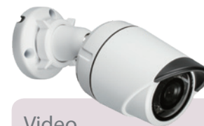
Video Surveillance Cameras